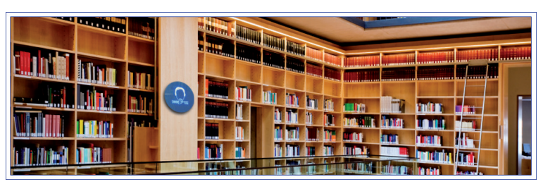
SoundSign<sup>™</sup> for Libraries